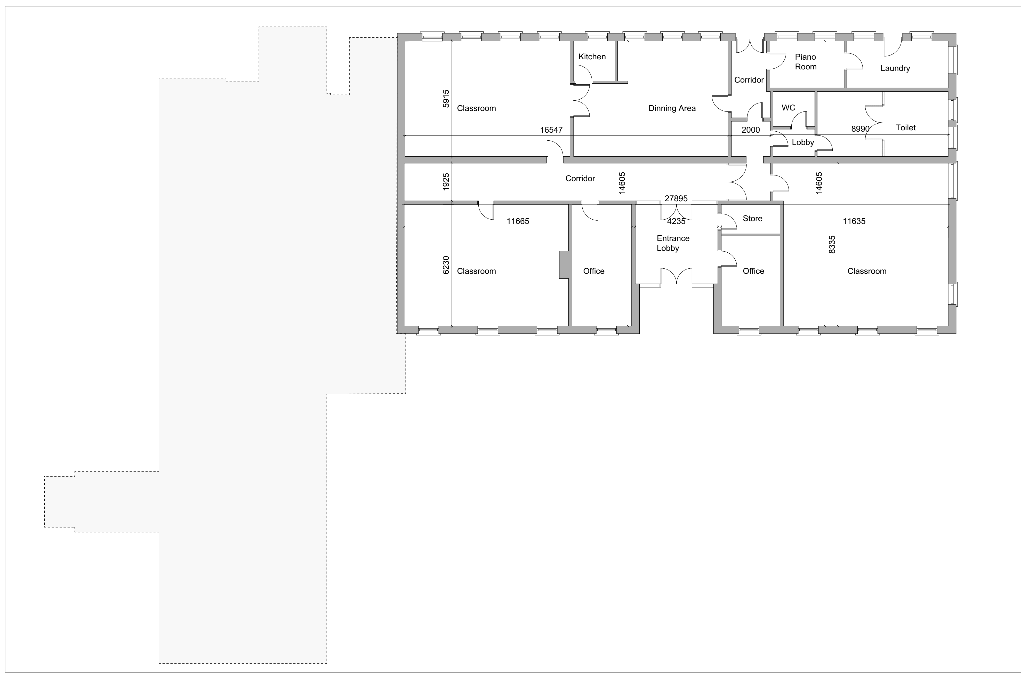
PROPOSED GROUND FLOOR PLAN SCALE 1:100