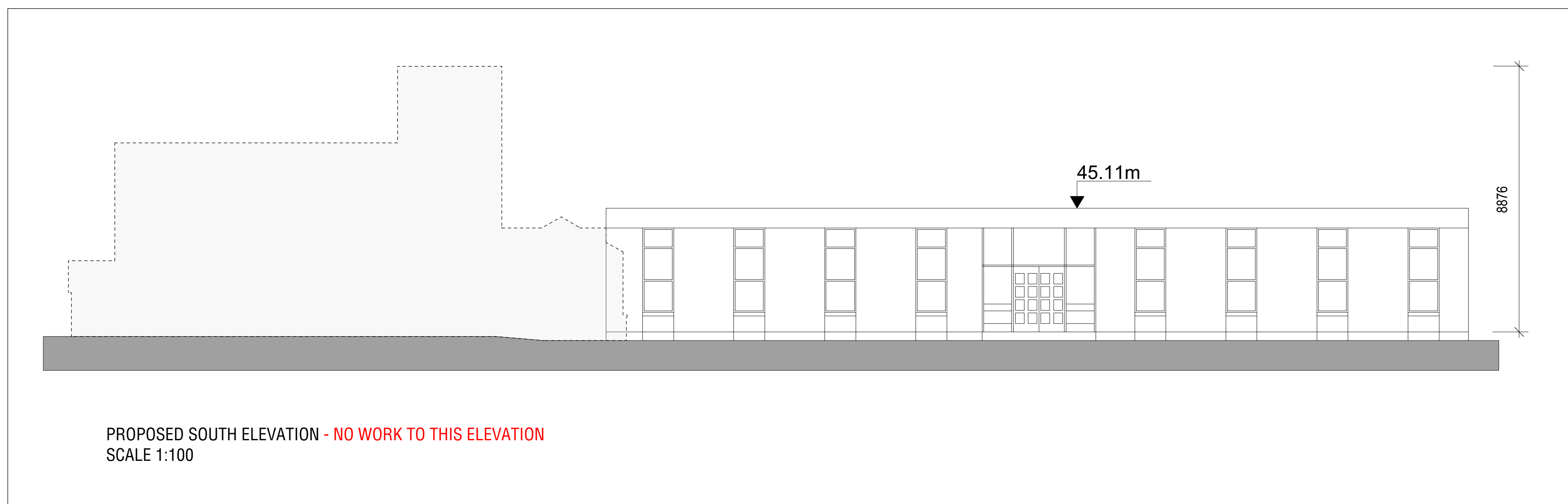
PROPOSED SOUTH ELEVATION - NO WORK TO THIS ELEVATION SCALE 1:100